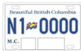
old motorcycle licence plate

Easier-to-read motorcycle licence plates will be available in May 2011. The licence numbers are 3/8 th of an inch larger and the new plate features the current provincial government logo.