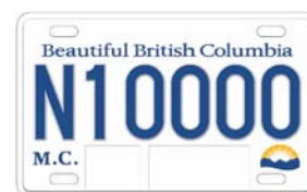
new motorcycle licence plate

A motorcyclist displaying the older-style licence plate doesn't have to exchange it for a new one.